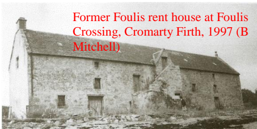
Former Foulis rent house at Foulis Crossing, Cromarty Firth, 1997

Until the end of the Napoleonic wars agricultural conditions were favourable to the farmers on the Black Isle. If work could not be found, men went into the army for employment. It was also well positioned for fishing, due to the long estuaries surrounding its land mass, and some Munros combined crofting with fishing. From 1814 however, there was a post-war collapse. Prices dropped and evictions resulted as landowners tried to obtain better returns from their lands through enclosures.