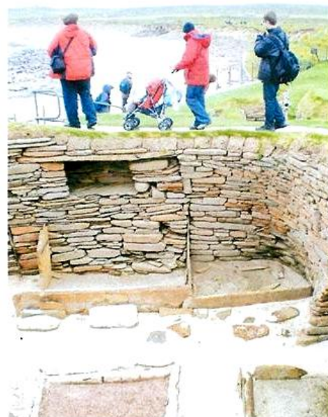
Brodgar far left and Skara Brae left give an idea of a time left behind.

The Orkney Islands are serviced by air and sea transport, with several ferries daily to and from the mainland at John O'Groats and Gills Bay. Bed and breakfast accommodation is plentiful and probably the best value, although the main towns also offer hostel and hotel accommodation.