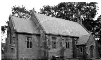
Holy Trinity Church, Berrima