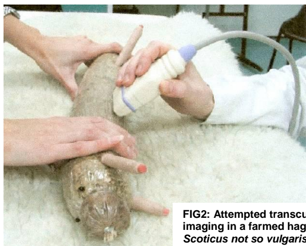
FIG2: Attempted transcutaneous imaging in a farmed hagg ( Haggis Scoticus not so vulgaris ) Note the absence of hair & the elongated body

Most of the haggii for production in Scotland are now farmed to cope with demand, while preserving wild