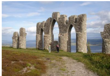
The Fyrish Monument